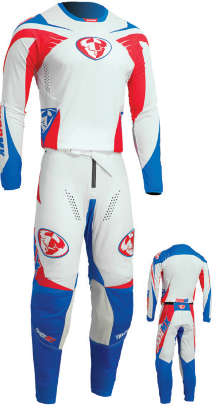
PULSE 04 LE RED/WHITE/BLUE

Jersey sizes S-3XL. $39.95 Pant sizes 28-44. $114.95