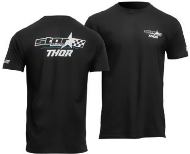
STAR RACING CHAMP TEE BLACK 100% cotton tee shirt with screen printed graphics on front chest and back. Sizes S-2XL. $24.95