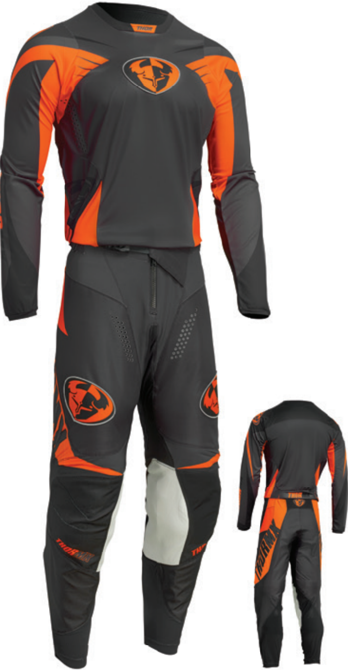
PULSE 04 LE CHARCOAL/ORANGE

Jersey sizes S-3XL. $39.95 Pant sizes 28-44. $114.95