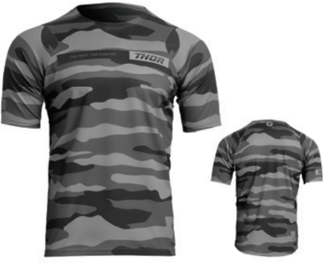
CAMO DARK GRAY