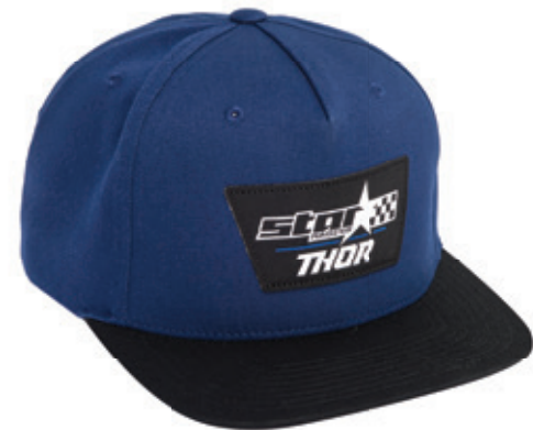
STAR RACING CHAMP SNAPBACK NAVY Five panel classic fit flat bill adjustable snapback with woven patch. OSFM. $21.95