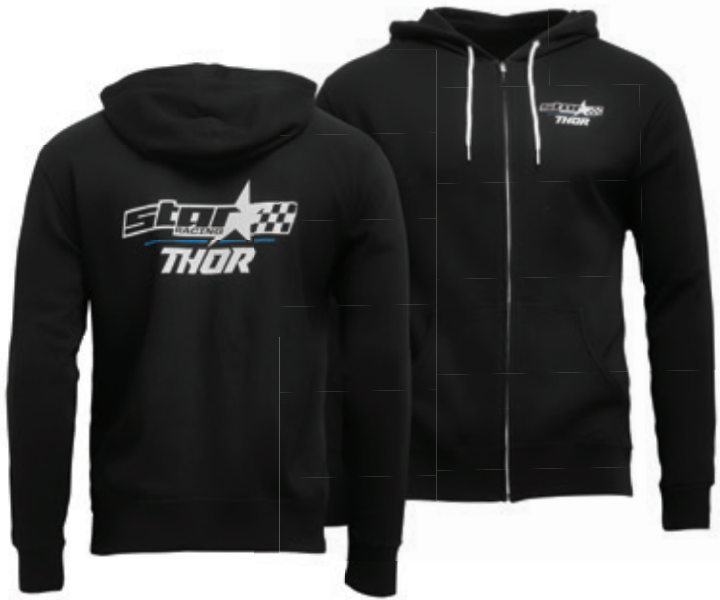
STAR RACING CHAMP ZIP-UP BLACK Midweight 80% cotton, 20% polyester zip-up hooded sweatshirt with screen printed Star Racing graphics. Sizes S-2XL. $49.95