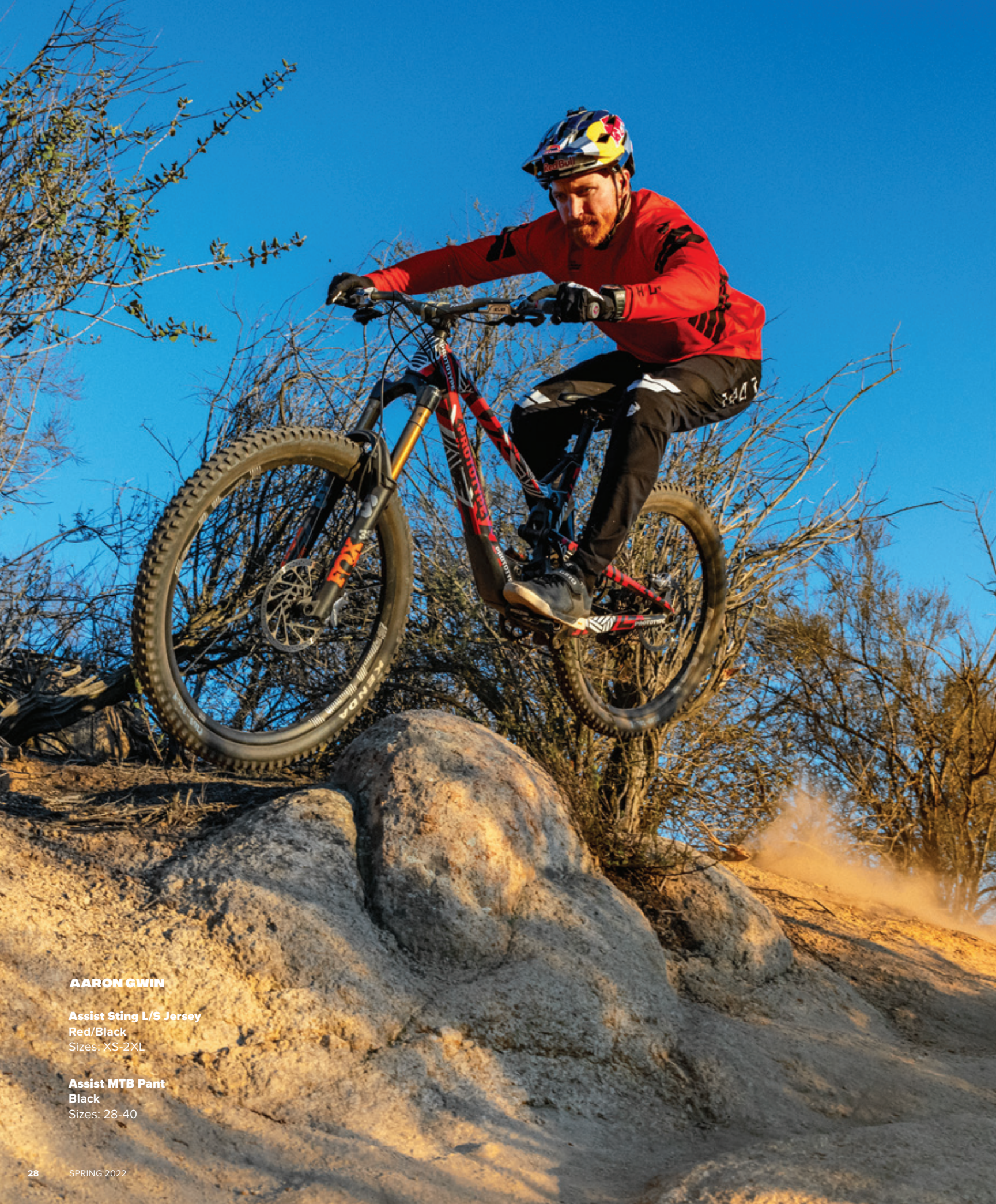
AARON GWIN Assist Sting L/S Jersey Red/Black Sizes: XS-2XL