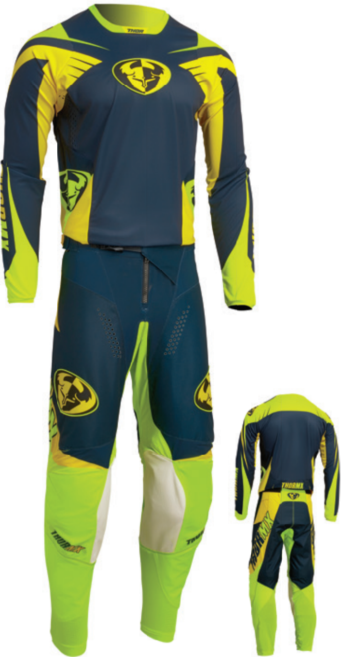
PULSE 04 LE MIDNIGHT/LIME