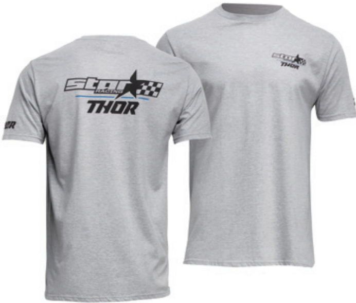
STAR RACING CHAMP TEE HEATHER GRAY 90% cotton, 10% polyester tee shirt with screen printed graphics on front chest and back. Sizes S-2XL. $24.95