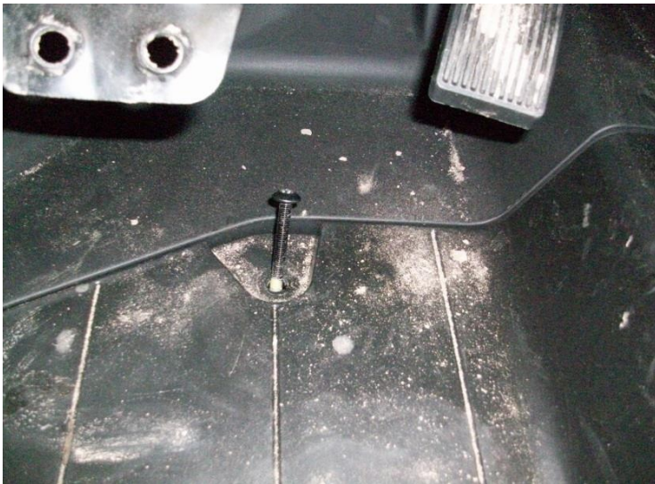
LEFT SIDE PICTURE