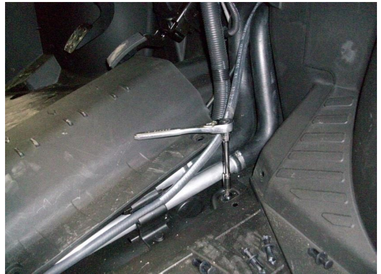
RIGHT SIDE PICTURE

Product has a one year manufacture defect warranty. Never accede 5 mph when plowing snow or you may cause damage not covered under warranty. Periodicly check bolts for tightness.