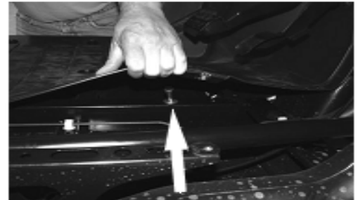
Pull up driver's side floor to install the hex bolt and washer through the frame.