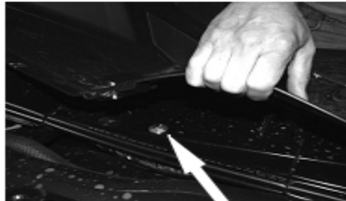
Pull up passenger side floor to install the hex bolt and washer through the frame.