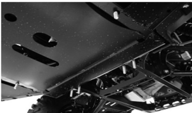
Front u-bolt and rear hex bolt positions.