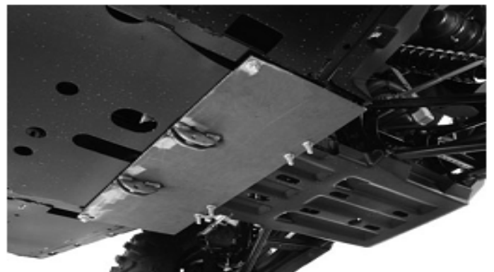
Front of Machine →