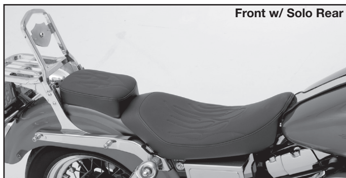
Front w/ Solo Rear