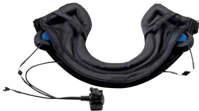
REMOVABLE NECK CURTAIN INCLUDES SPEAKER POCKET (SPEAKERS NOT INCLUDED)