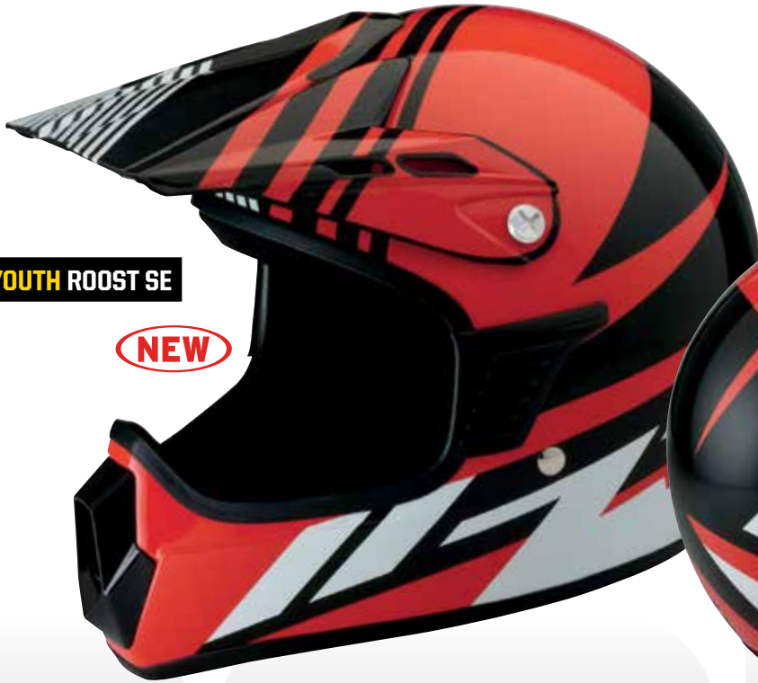
YOUTH ROOST SE