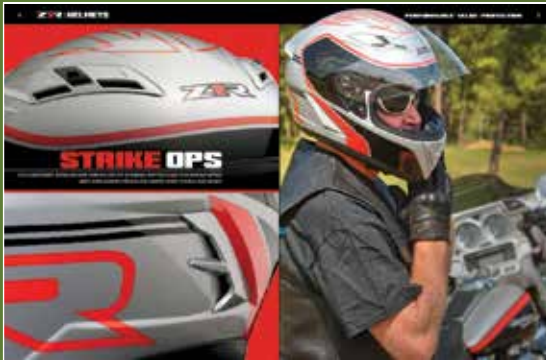
FULL FACE STREET HELMETS 4-15

YOU DON'T THROW A LEG OVER YOUR FAVORITE MACHINE BECAUSE YOU HAVE TO. IT'S BECAUSE YOU "CHOOSE" TO. YOU SPEND YOUR HARD-EARNED DOLLARS ON RECREATIONAL ACTIVITIES THAT SATISFY YOUR BASIC INSTINCT TO ESCAPE THE DAILY GRIND. AT ZIR, IT'S OUR MISSION TO PROVIDE YOU WITH HIGH QUALITY AND HIGH PERFORMING PRODUCTS AT AFFORDABLE PRICES. WHEN YOU DECIDE TO PURSUE KNOWN OR UNKNOWN DESTINATIONS, THE RIDE IS ALL WE WANT YOU THINKING ABOUT.