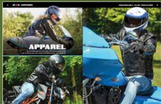
MEN'S AND WOMEN'S APPAREL 52-71