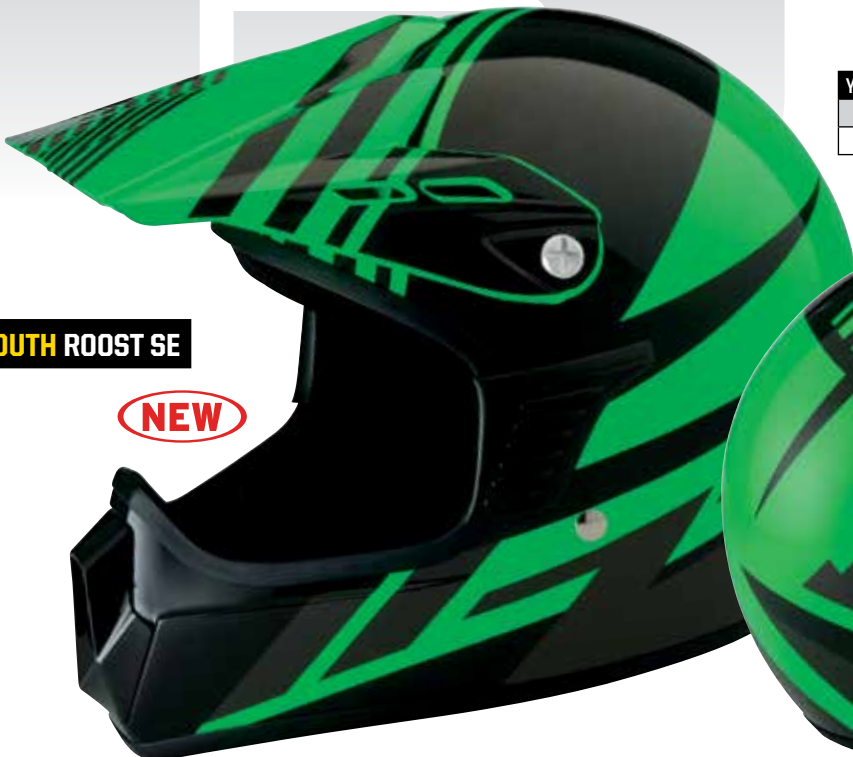
YOUTH ROOST SE

CONTOURED FOR A CHILD'S HEAD. LIGHTWEIGHT, COMPACT SHELL FOR OPTIMAL FIT AND COMFORT.