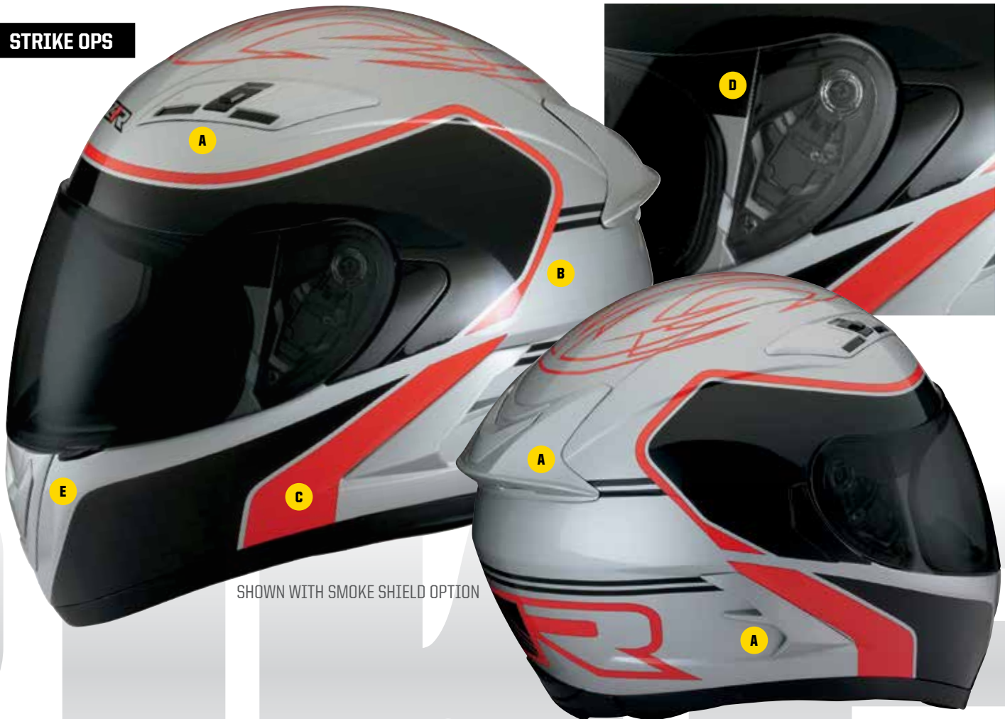
SHOWN WITH SMOKE SHIELD OPTION