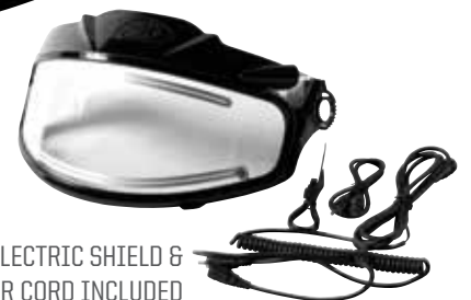
ELECTRIC SHIELD & POWER CORD INCLUDED