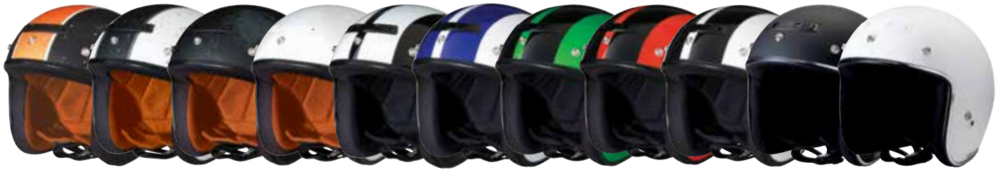
CHICO | DISTRESSED CHECKER | RETRO 2 | RUBATONE