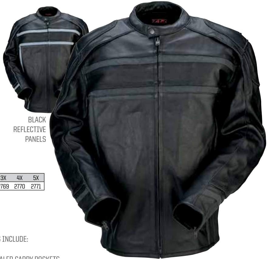
BLACK REFLECTIVE PANELS