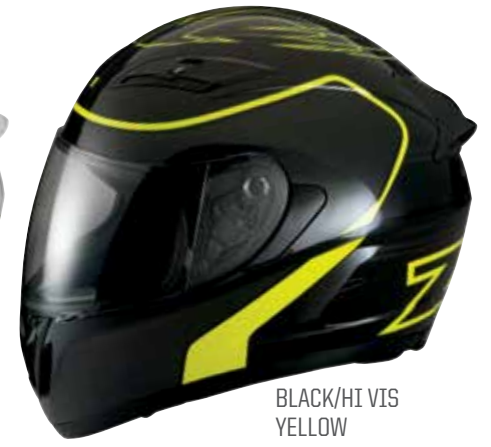
BLACK/HI VIS YELLOW