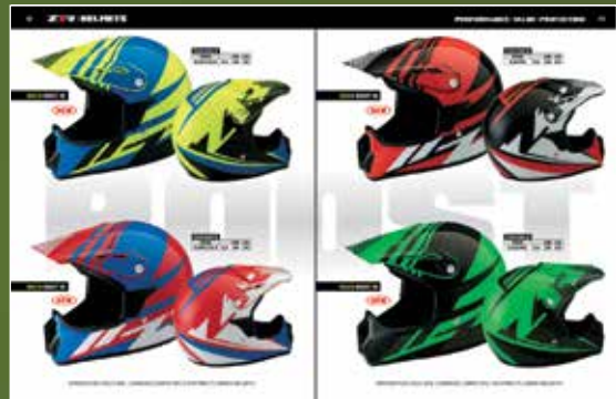
YOUTH HELMETS 42-46