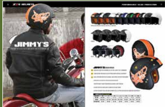
1/2 AND 3/4 STREET HELMETS 16-33