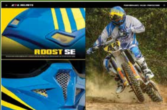
DIRT HELMETS 34-41