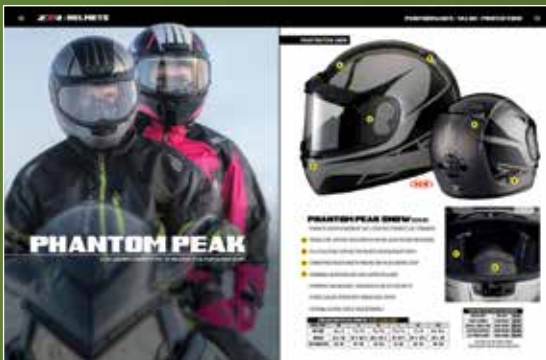
FULL FACE SNOW HELMETS 47-51